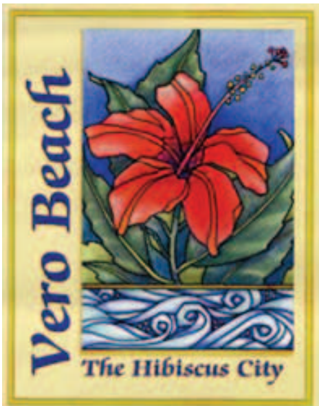
Vero Beach, The Hibiscus City

Every Friday from 9AM-2PM in Pocahontas Park (corner of 14th Ave. and 21st Street)... Enjoy fresh fruits, vegetables, baked goods, plants, music, and much more!